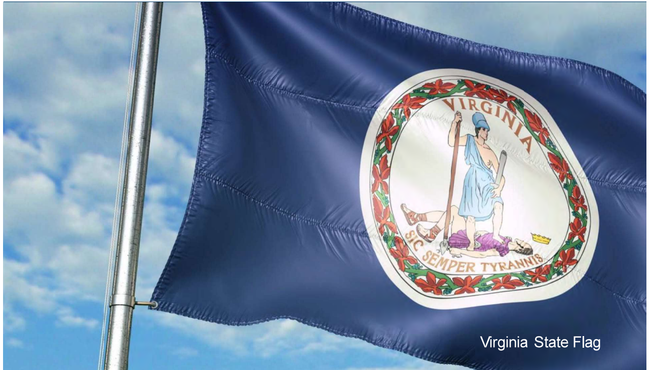
Virginia State Flag