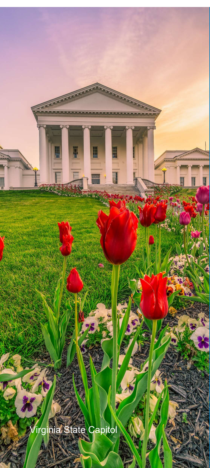
Virginia State Capitol