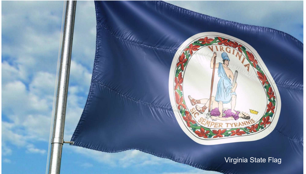
Virginia State Flag