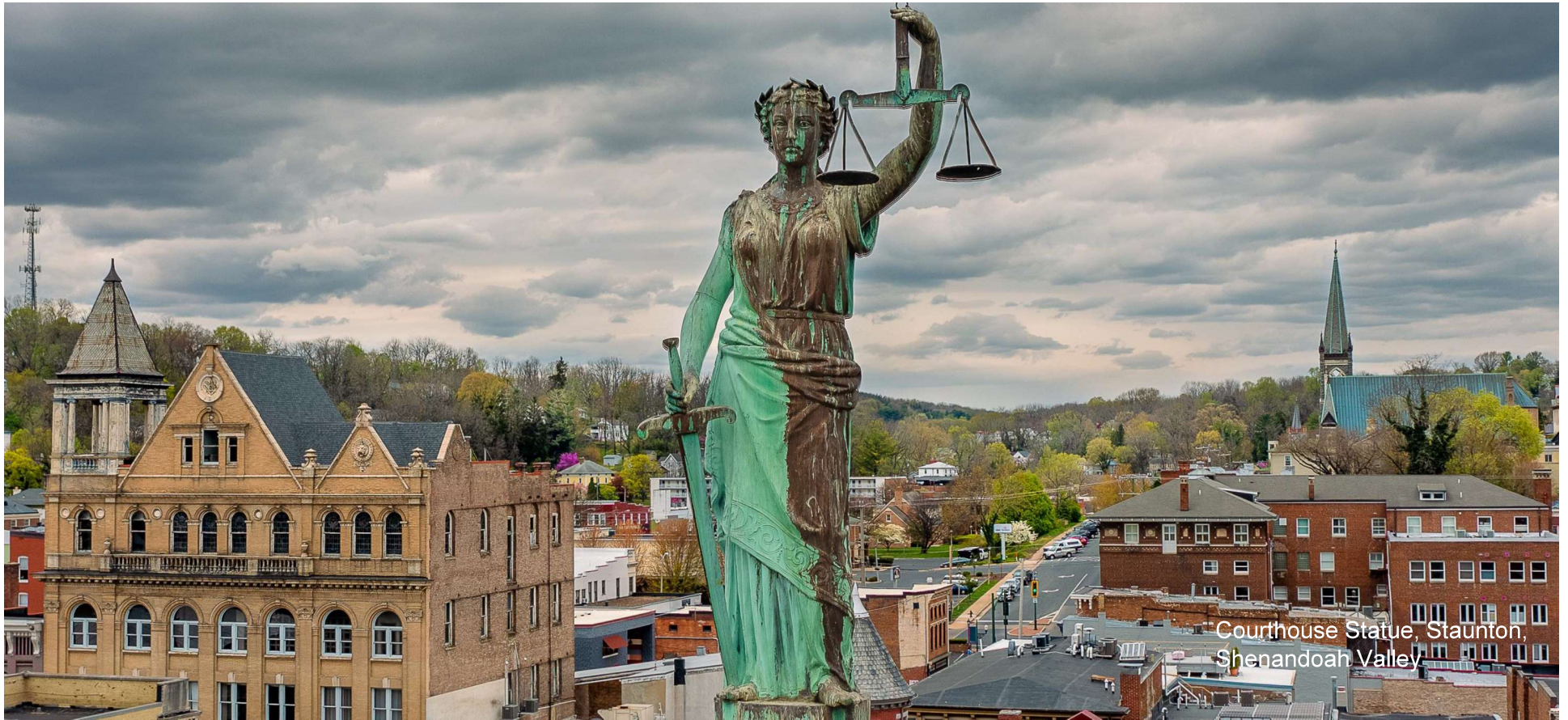
Courthouse Statue, Staunton, Shenandoah Valley