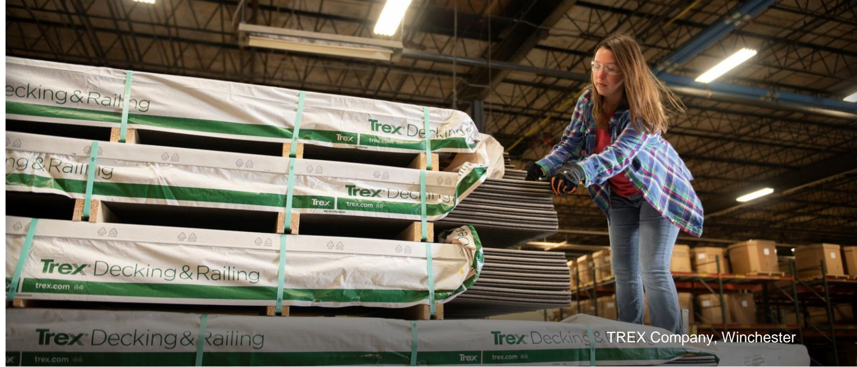
& TREX Company, Winchester