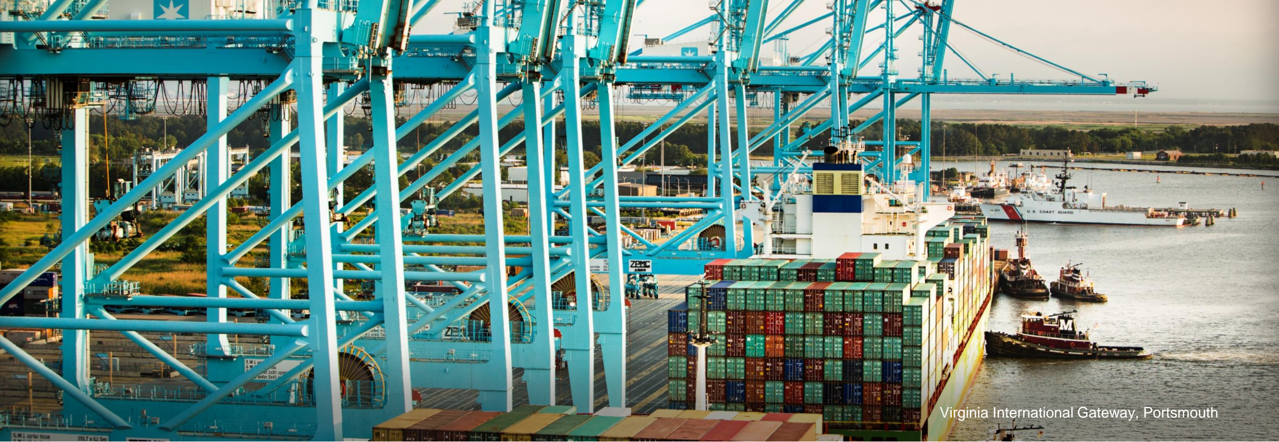
Virginia International Gateway, Portsmouth