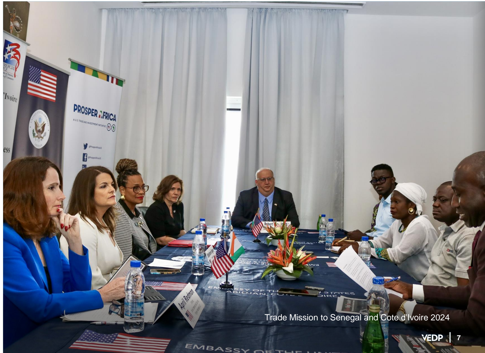
Trade Mission to Senegal and Cote d'Ivoire 2024

“[The impact of this event was] being able to explore new markets, engage with local communities, and forge meaningful connections with fellow business leaders. The insights gained and relationships formed will undoubtedly pave the way for exciting collaborations and opportunities in the future.”