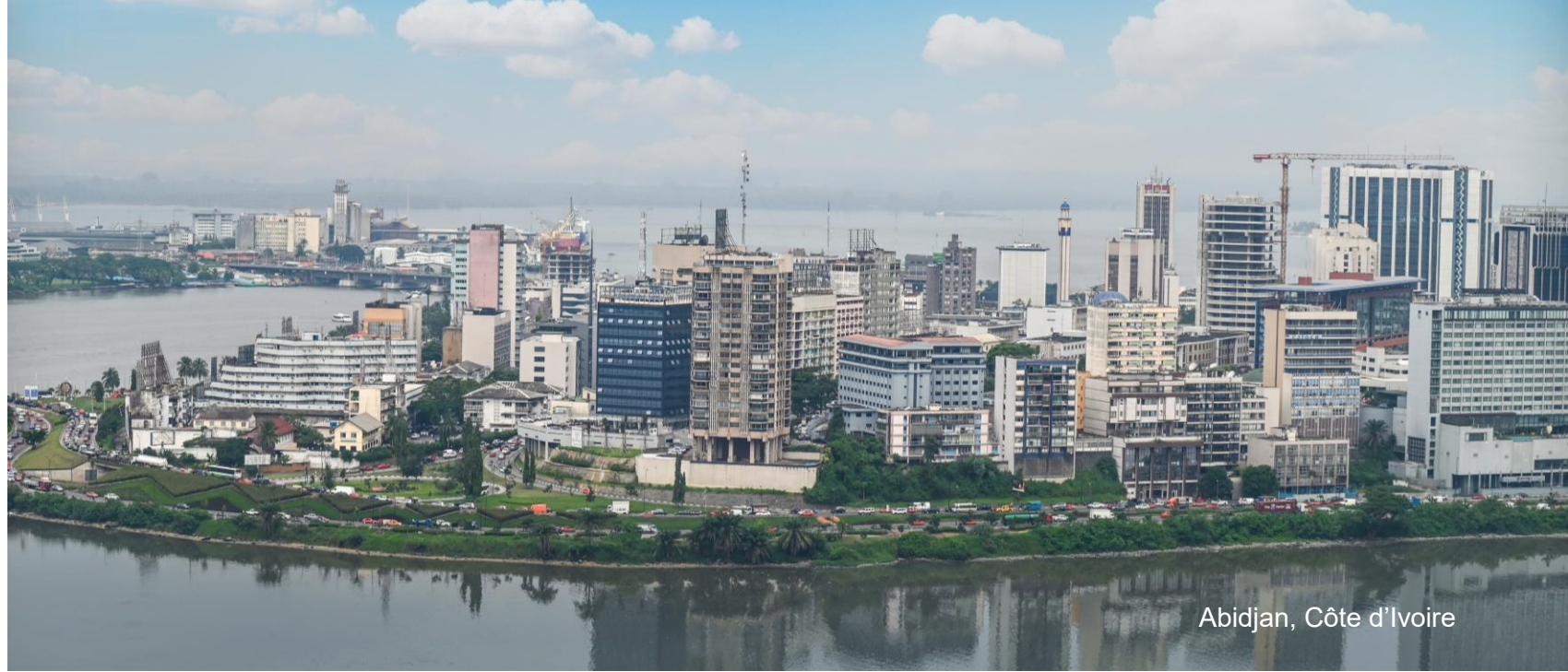
Abidjan, Côte d'Ivoire