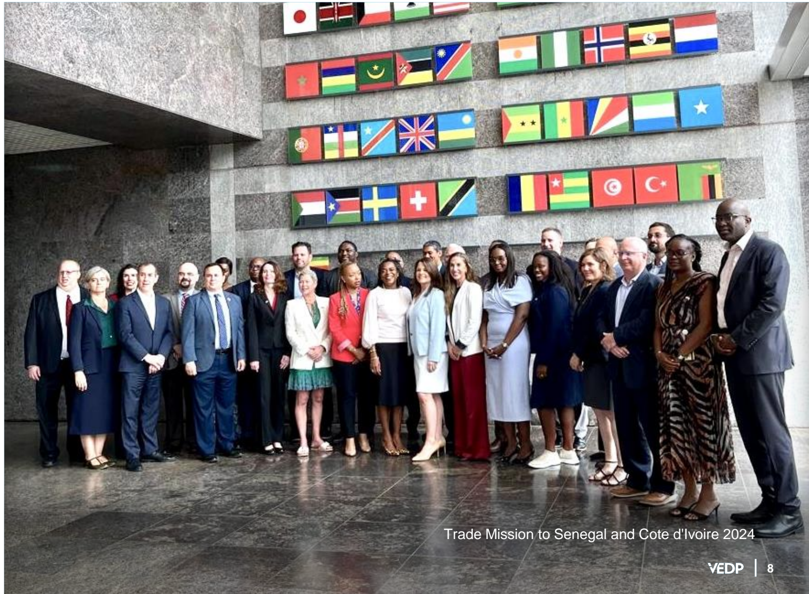
Trade Mission to Senegal and Cote d'Ivoire 2024

“Participation in the [trade mission] was an overwhelming success. The delegation's engagements were marked by a series of productive meetings with key officials and business leaders, resulting in promising connections that will assist future business relations in the country. The collaboration between the Dept of Commerce, Embassy, as well as other agencies assisted in receiving a better understanding of the potential business opportunities available. Connecting with the African Development Bank, USAID, and Millenium Challenge will enhance our ability to participate in projects funded by these entities. We have already had follow up sessions with three potential clients.”